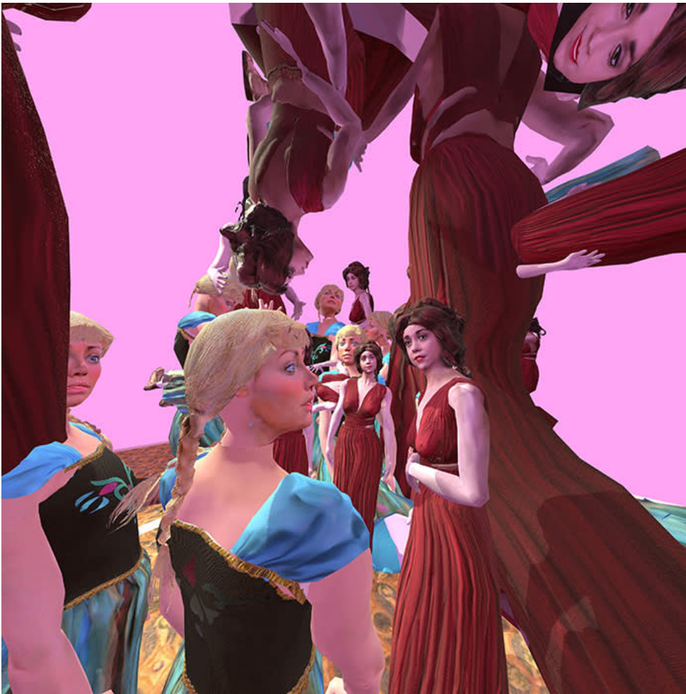
Paul McCarthy's 'C.S.S.C. Coach Stage Stage Coach VR experiment Mary and Eve' (2017)

The barriers to entry are lower at art fairs. People whisper in museums, but never in a fair