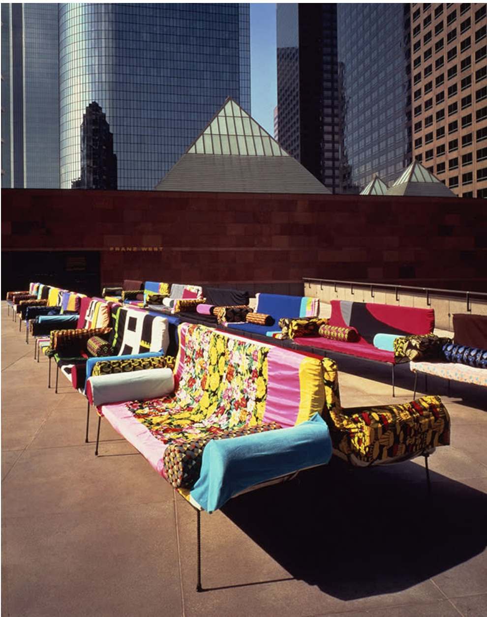
Franz West's 'Rest' (1994)